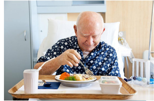
NEW CUSTOM FOOD PROTOCOL

8,442 impressions 113 engagements 21 likes 10 retweets