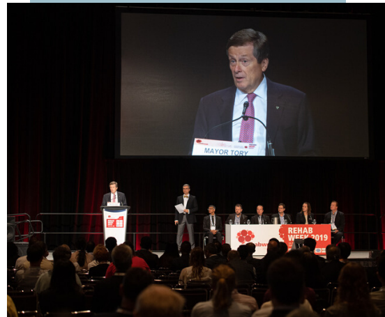
MAYOR JOHN TORY OPENS REHABWEEK2019

13,618 impressions 131 engagements 31 likes 8 retweets