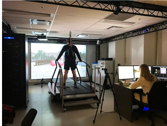
CRANIA CONFERENCE NEWS STORY

8,442 impressions 113 engagements 21 likes 10 retweets