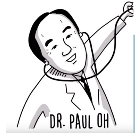
SIGNS OF A HEART ATTACK WITH DR. PAUL OH

5,916 impressions 156 engagements 38 likes 8 retweets